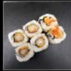
SHRIMP TEMPURA ROLL SHRIMP TEMPURA, MAYO