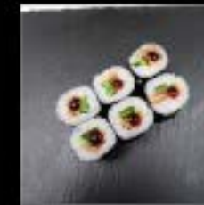
EEL CUCUMBER ROLL