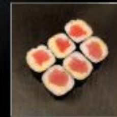
SPICY TUNA ROLL