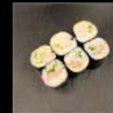
YELLOW TAIL & ONION ROLL