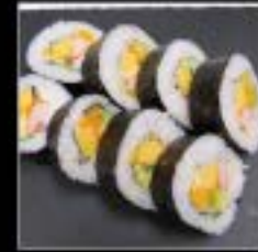
CALIFORNIA FUTOMAKI ROLL