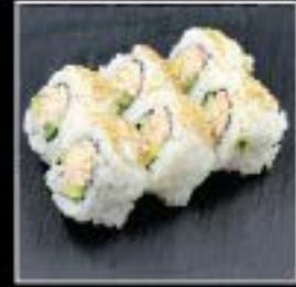
CALIFORNIA SPECIAL ROLL CRAB SALAD, AVOCADO, CUCUMBER