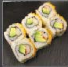
INSIDE OUT CALIFORNIA CRAB, AVOCADO, MASAGO