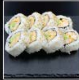
SPICY SHRIMP SPECIAL ROLL SHRIMP, AVOCADO, LETTUCE CUCUMBER, CRAB, GREEN ONION SPICY MAYO