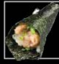
TORO & ONION