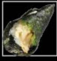
YELLOW TAIL & ONION