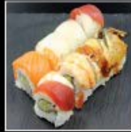
RAINBOW ROLL CRAB, AVOCADO, TUNA, SALMON, EEL, SHRIMP, WHITE FISH