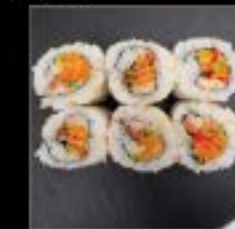
SMART ROLL CRAB, GREEN, YELLOW & RED PEPPERS, SPICY MAYO