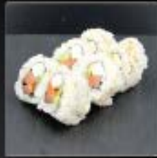
PHILADELPHIA SMOKED SALMON, CREAM CHEESE, CUCUMBER, AVOCADO