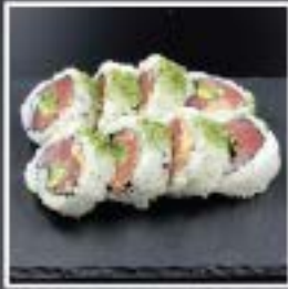
MICHIGAN ROLL TUNA, CUCUMBER, AVOCADO, SPICY MAYO SAUCE