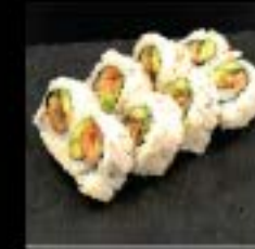
EEL AVOCADO ROLL