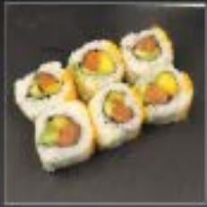
TROPICAL ROLL SMOKED SALMON, MANGO, MASAGO