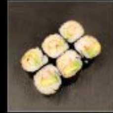
CALIFORNIA SPICY ROLL CRAB, AVOCADO, CUCUMBER, SPICY MAYO