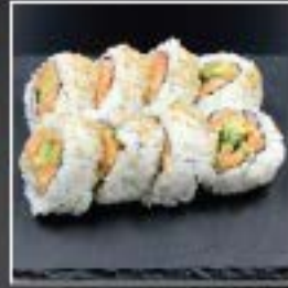
SPICY SALMON SPECIAL ROLL SALMON, AVOCADO, CRAB, CUCUMBER, LETTUCE, SPICY MAYO