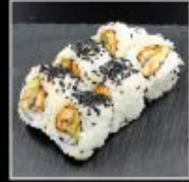
CRAZY EEL ROLL EEL, AVOCADO, SRIRACHA TEMPURA CRISPS

These items may contain raw or undercooked ingredients. Consuming raw or undercooked meats, poultry, seafood, shellfish, or eggs may increase your risk of foodborne illness. Noble Fish sushi rice ingredients: Cooked rice, sugar salt, blended vinegar (natural grain extract made of wheat, sake cake, rice, corn, water, salt dashi)