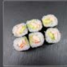
SHRIMP CALIFORNIA SHRIMP, AVOCADO, CUCUMBER