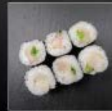
SPICY WHITE FISH ROLL