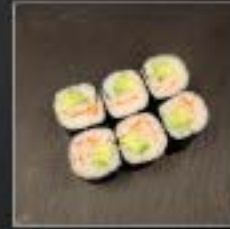
CALIFORNIA CRAB, AVOCADO, CUCUMBER