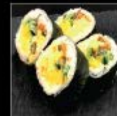
NOBLE ROLL GRILLED SALMON SKIN, SMELT ROE, OSHINKO, EGG, CUCUMBER, MAYO