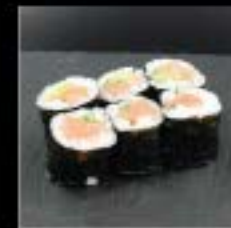
TORO & ONION