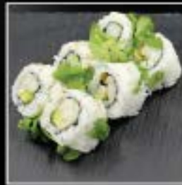
TIJUANA ROLL YELLOW TAIL, AVOCADO, JALAPENO, CILANTRO