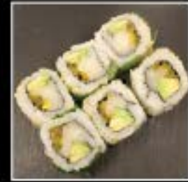
MONTEREY ROLL ESCOLAR, AVOCADO, JALAPENO, CILANTRO