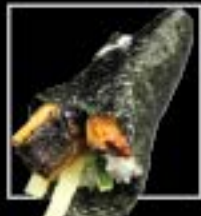
EEL & CUCUMBER