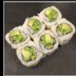
VERY VEGGIE ROLL AVOCADO, CUCUMBER, ASPARAGUS