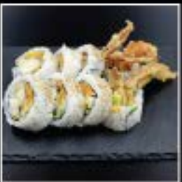
SPIDER ROLL SOFT SHELL CRAB, SMELT ROE, CUCUMBER, LETTUCE, SPICY MAYO