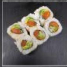
ALASKAN SMOKED SALMON, SMELT ROE, CUCUMBER, AVOCADO