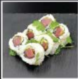
ALCAPULCO ROLL TUNA, AVOCADO, JALAPENO, CILANTRO