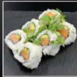
CANCUN ROLL SALMON, AVOCADO, JALAPENO, CILANTRO